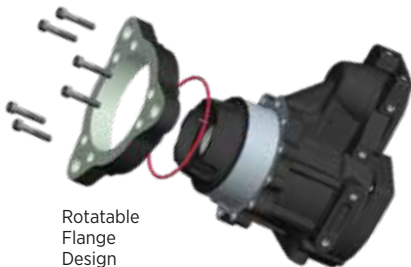
Rotatable Flange Design